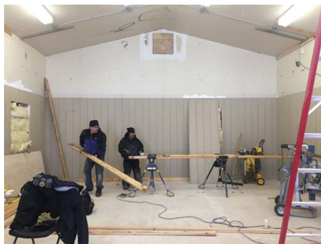
New clinic construction project in Birch Creek